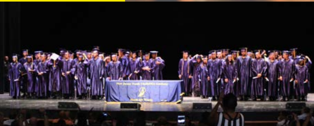
GRADUATES OF THE NEW JERSEY NATIONAL GUARD'S YOUTH CHALLENGE ACADEMY TURN THEIR TASSLES TO SIGNIFY THE END OF THEIR ACADEMY EXPERIENCE.