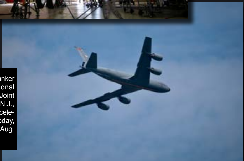
A U.S. Air Force KC-135 Stratotanker from the New Jersey Air National Guard's 108th Wing flies over Joint Base McGuire-Dix-Lakehurst, N.J., Aug. 31, 2016. The KC-135 is celebrating its 60th Anniversary today, having made its first flight on Aug. 31, 1956.