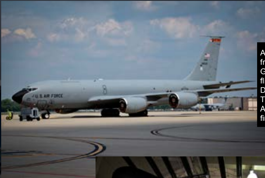
A U.S. Air Force KC-135 Stratotanker from the New Jersey Air National Guard's 108th Wing sits on the flight line at Joint Base McGuire-Dix-Lakehurst, N.J., Aug. 31, 2016. The KC-135 is celebrating its 60th Anniversary today, having made its first flight on Aug. 31, 1956.