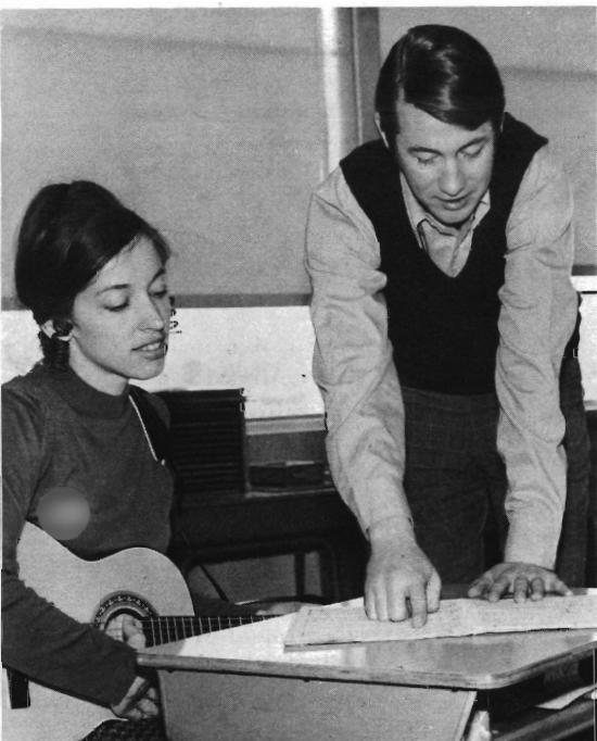
NEIGHBORHOOD PROGRAMS — The pictures on these pages describe some of the different activities being conducted for low-income residents of Bridgeton by the city's Board of Education with financial assistance from the Department. Above, young adults learn to play the guitar at the Cherry Street School. At right, pre-kindergarten and elementary school pupils sing, learn English as a second language, and work educational puzzles at the Bank Street School.

Every weekday evening and Saturday morning the Quarter Mile Lane, Cherry Street and Bank Street Elementary Schools in Bridgeton bustle with activity.