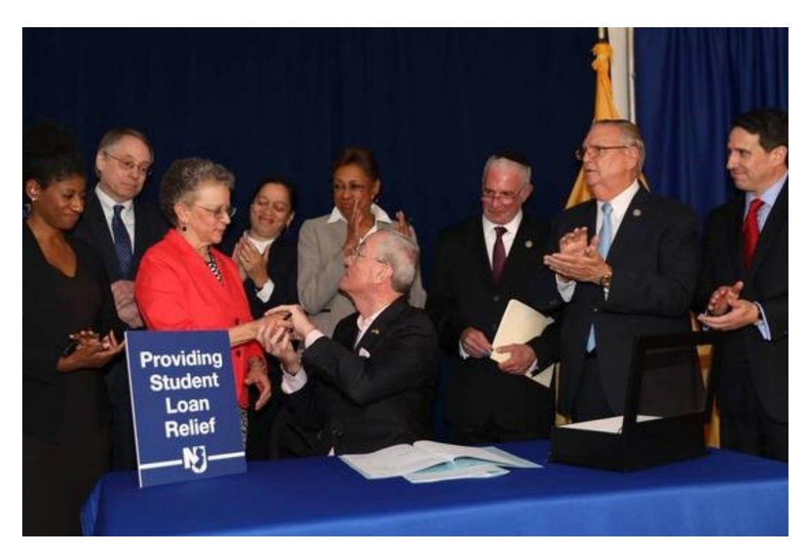
Governor Murphy Signs Legislation To Make Student Loans More Affordable

Governor Murphy signed two pieces of legislation to assist student loan borrowers who are struggling with repayment.