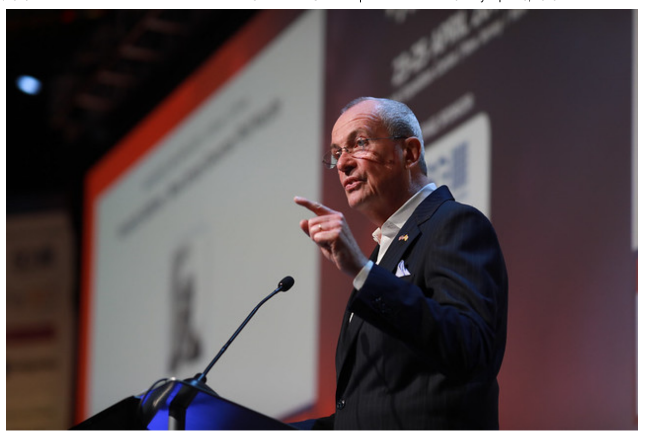
Governor Murphy Gives Keynote Address At Betting On Sports America Conference

Governor Phil Murphy delivered the keynote address at the Betting on Sports America Conference. The sports wagering industry will create 6,000 new jobs in New Jersey by 2020. New Jersey is the second largest sports betting market in the country, and Governor Murphy's goal is to soon be number one.