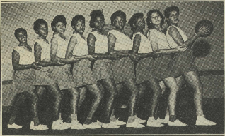
Members of Last Year's Squad