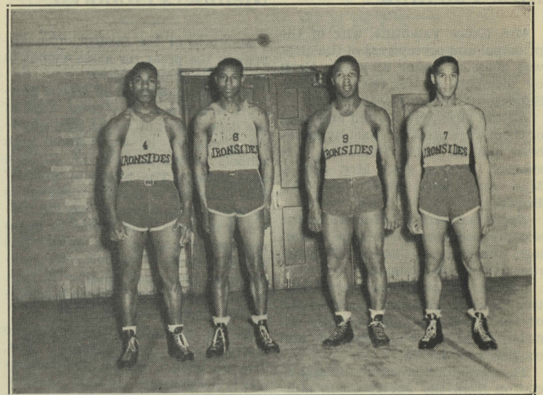
Letter Men of Last Year's Squad