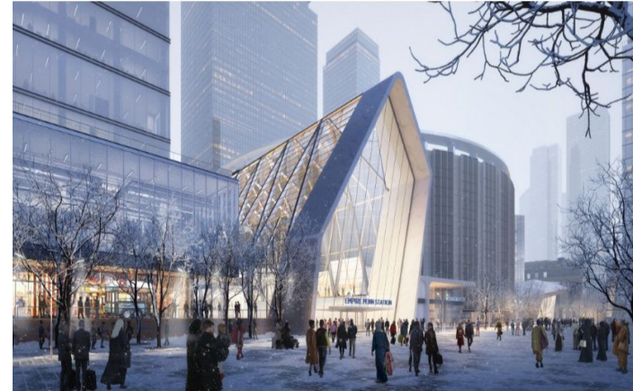
MTA Penn Expansion Rendering