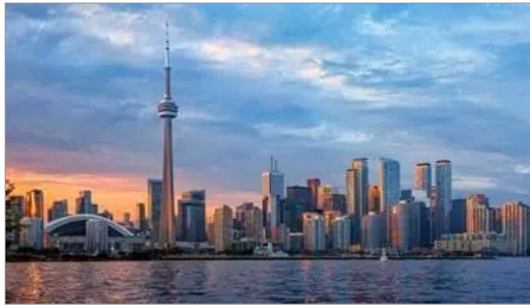
Canada's Best Employers