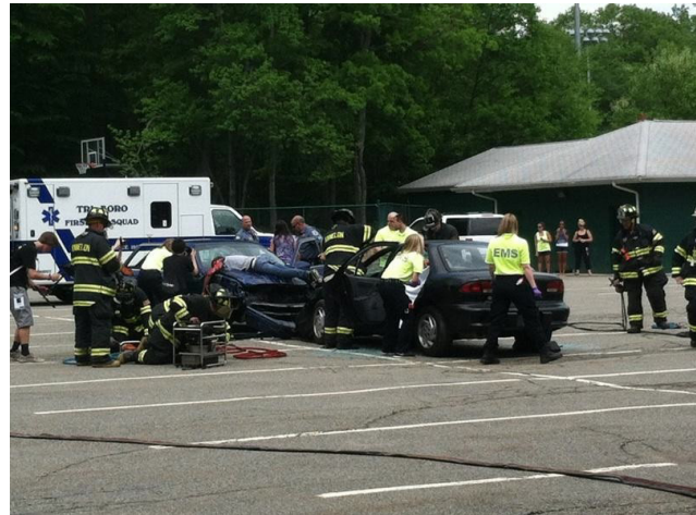
A staged drunk driving accident was the focus of training staff from the Kinnelon Municipal Court.

Municipal staff, municipal courts, and schools throughout the Morris/Sussex vicinage have participated in the Every 15 Minutes program.