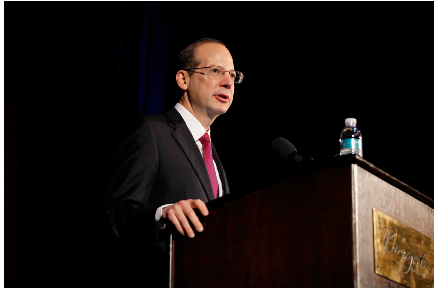
Chief Justice Stuart Rabner addresses the annual meeting of the New Jersey State Bar Association in Atlantic City in May.

In the five years since the program began, more than 11,000 cases have completed mediation, and more than 5,000 cases have been settled - before, during, and after actual mediation sessions.