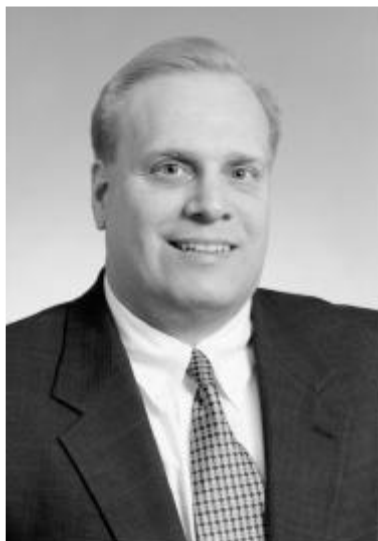
DAVID C. HESPE Commissioner of Education