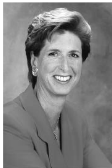
GOV. CHRISTIE WHITMAN

“Preparing the next generation of agricultural workers to fill these demanding positions can only be accomplished if our agricultural curriculums remain on the cutting edge in the decades ahead.”