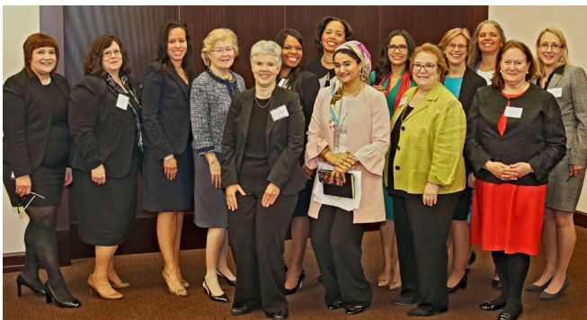
The presenters spoke to more than 100 people at the summit, which was held on April 25 at the New Jersey Law Center in New Brunswick.