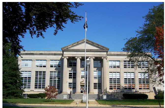
The Monmouth County Courthouse in Freehold as it appears today.