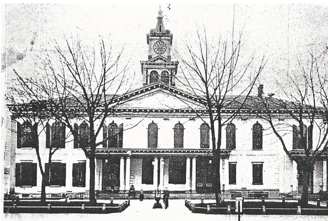
The current Hall of Records in Freehold. Under a deed provision, the land will revert to the previous owner if the property ceases serving as a courthouse.