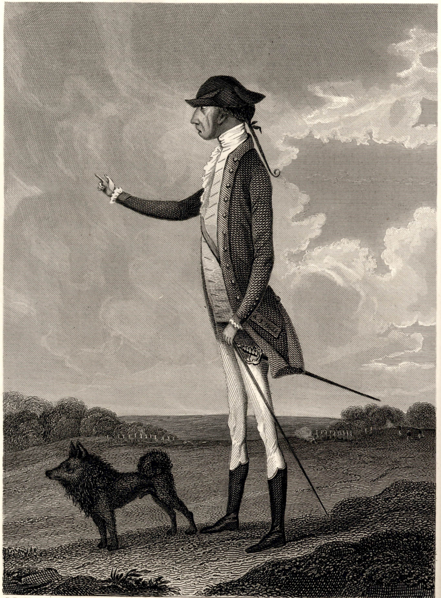
MAJOR GEN. L CHARLES LEE.