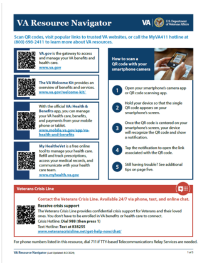
First page of the VA Resource Navigator