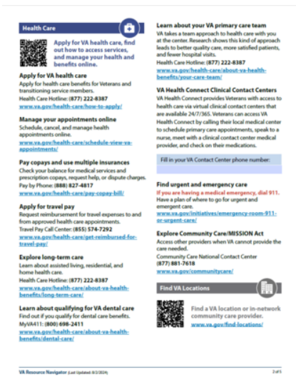
Second page of the VA Resource Navigator