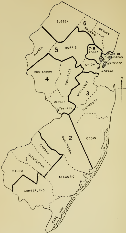
Map of the New Jersey Congressional Districts