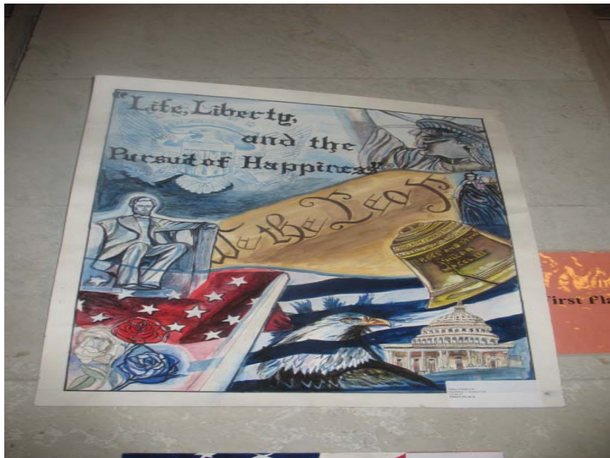
This poster was on display during Law Day festivities in Hudson Vicinage. Children from across Hudson County participated in the contest.