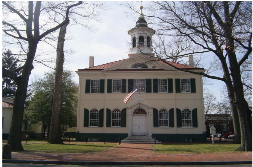
The Old Burlington County Courthouse in Mount Holly was the subject of a film that highlighted its history and architecture.

The anniversary of JCCs was recently marked by honoring a long-standing volunteer in Monmouth Vicinage who has served the program from more than 50 years.