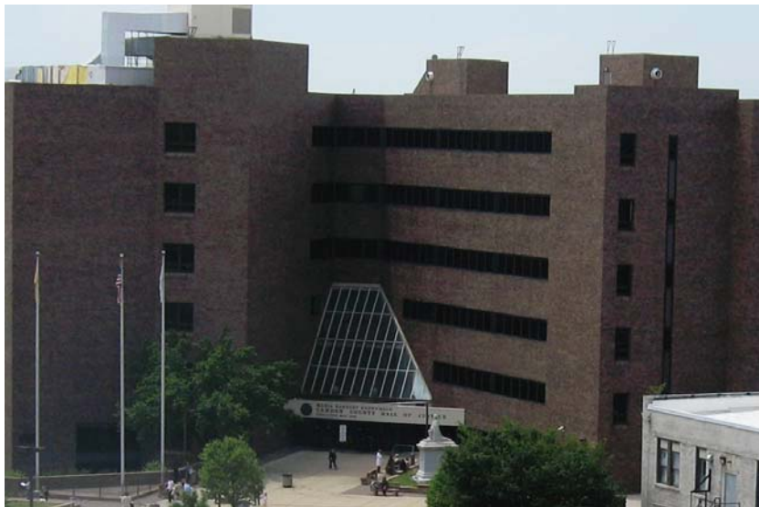
The new Camden County Courthouse will be constructed on a parking lot across the courtyard from the Camden County Hall of Justice in Camden. Camden Vicinage has one of the largest case loads in the state.

Several changes are under consideration, including introduction of a monthly e-newsletter and using the Judiciary Times to showcase feature writing and photography.