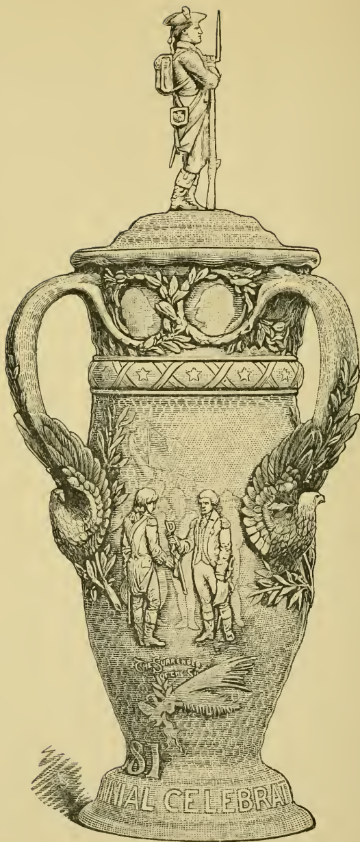
VASE AWARDED THE NEW JERSEY BATTALION AT THE CENTENNIAL CELEBRATION OF THE SIEGE OF YORKTOWN, VA., 1881.