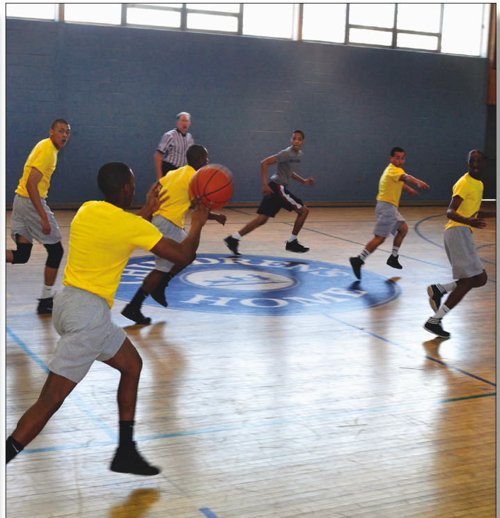
New Jersey Youth Challenge cadets visited the Children's Home in Mount Holly for a basketball game Feb. 15, 2013. In a close game, the Children's Home edged the cadets 37-36. The Children's Home encourages its students to play sports as a way to build character and foster the youth to become more confident.