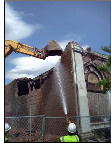
Demolition activities in Jersey City.

The SDA's current portfolio of active projects is extensive, valued at over $2.2 billion. This includes ongoing work on the 2011 and 2012 Capital Project portfolios (more than $1 billion), additional projects in construction ($194 million), emergent projects ($50 million) and Regular Operating District grants ($792 million state share).