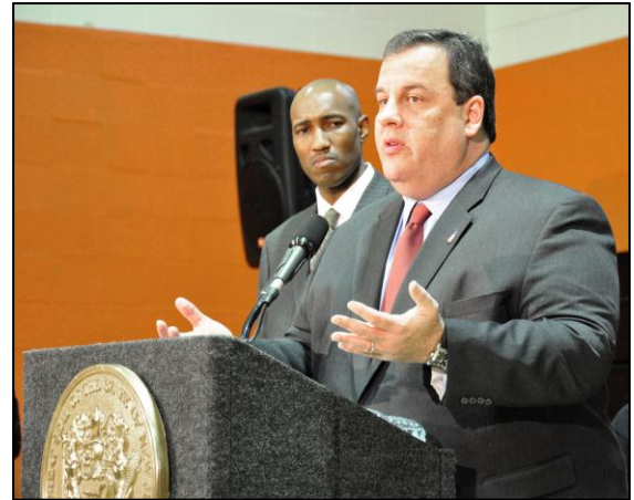
Governor Christie announces the 2012 Capital Portfolio.

Exactly one year after Governor Christie announced the advancement of the 2011 Capital Project Portfolio, he announced an additional 20 projects set to advance in 2012 as part of the SDA's Capital Program. This announcement continues the Governor's commitment to implementing meaningful reforms and key changes providing the SDA the means to construct school facilities projects efficiently and cost effectively.