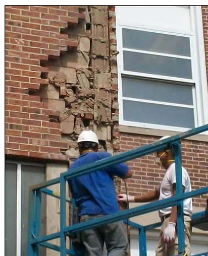
Emergent construction activities at Whitney E. Houston Academy in East Orange.

During the reporting period, the replacement of three different roofing systems at the William B. Cruise Memorial School No. 11 in Passaic was also completed. A $1,516,746 general construction contract was awarded to D.A. Nolt Inc. of Berlin, NJ to replace the existing roofs of the school, which educates more than 1,300 students in grades pre-kindergarten through fifth.