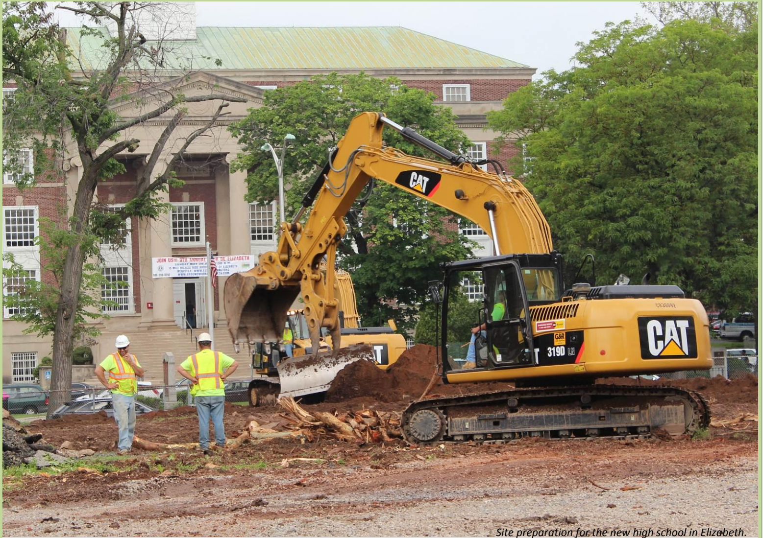
Site preparation for the new high school in Elizabeth.