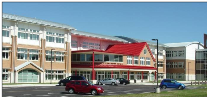
Midtown Community Elementary School in Neptune.

The SDA strives to build state of the art schools that are energy-efficient and environmentally friendly, affording every child in the state the best possible opportunities to learn.