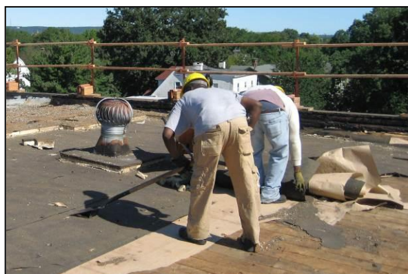
Emergent construction activities at Dionne Warwick Institute in East Orange.

During the first two years of the Christie Administration, SDA started construction on 32 SDA-managed emergent projects—23 in 2010 and nine in 2011. A total of 81 additional emergent conditions were addressed during that time through delegation—where the SDA funded the projects, but the districts themselves managed them. More emergent projects have been completed during Governor Christie’s tenure than during that of any other governor.