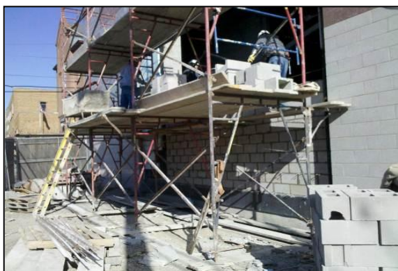
Construction at Columbus Elementary School in Union City.

In October 2011, the SDA also restarted construction on the Victor Mravlag School No. 21 in Elizabeth. The project had experienced construction delays stemming from unforeseen structural deficiencies and environmental issues. Under Governor Christie's