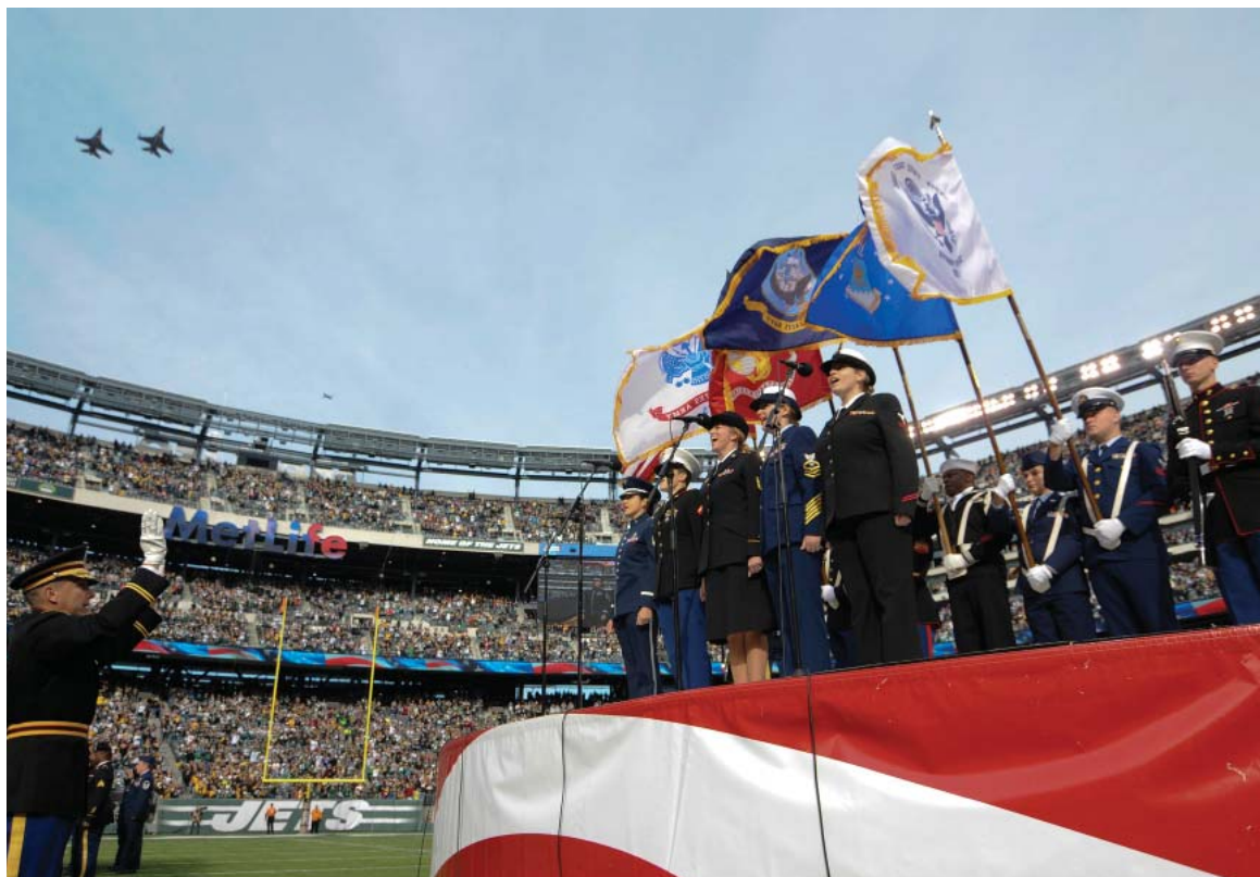
Photo left: F-16 Fighting Falcons from the 177th Fighter Wing fly overhead as service-members from each branch of the military sing the National Anthem at MetLife Stadium on Nov. 9, 2014. The National Football League honored military members as part of their Salute to Service event. Photo below: Soldiers from the New Jersey Army National Guard's 50th Infantry Brigade Combat Team participated in the pre-game ceremonies at MetLife Stadium in East Rutherford, N.J., Nov. 9, 2014.