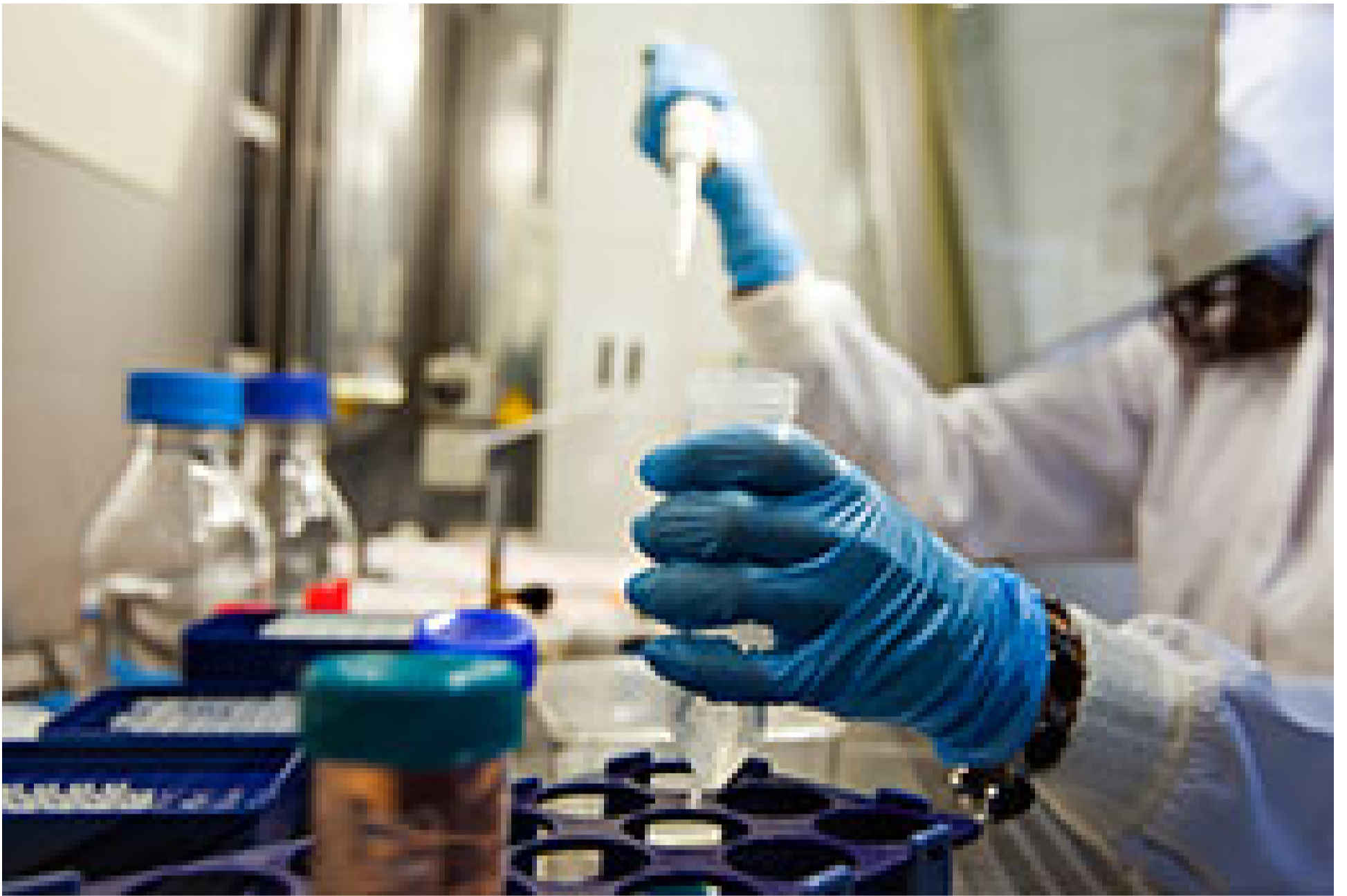
Camden Cancer Research Center

Connecting scientists and empowering collaborative research to develop the next generation of cancer treatments