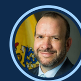
Robert Asaro-Angelo, Commissioner of Labor, New Jersey

By modernizing our call centers, we've significantly enhanced our ability to assist New Jersey workers. In unemployment insurance, we were able to connect 15% more callers to agents during peak times. We reduced caller abandonment in temporary disability and family leave insurance from 34% to under 2%. These efforts demonstrate our steadfast commitment to continuing to improve how we serve New Jersey workers in need."