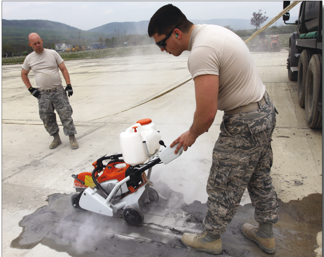
Airmen from the 108th Civil Engineer Squadron, New Jersey National Guard, make repairs to a concrete area simulating an airfield flight line during their predeployment exercise at Fort Indiantown Gap, Pa., April 21. Photo below, tool bag used by the electrical systems personnel to perform their job.

So as an upcoming deployment seems imminent for these Airmen, maintaining their skills to complete all of these