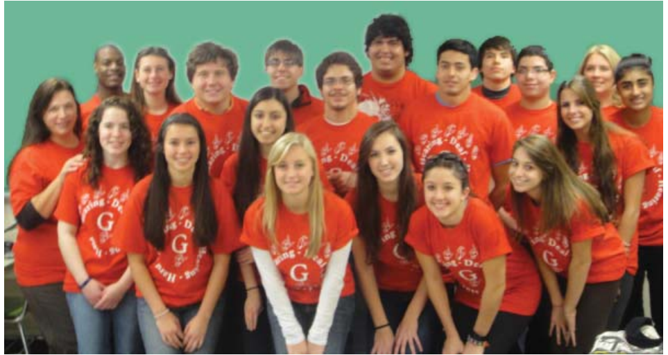
ASL Club students from Governor Livingston High School