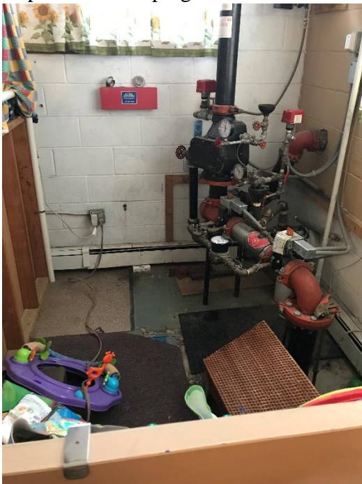
Toys stored in a mechanical room.