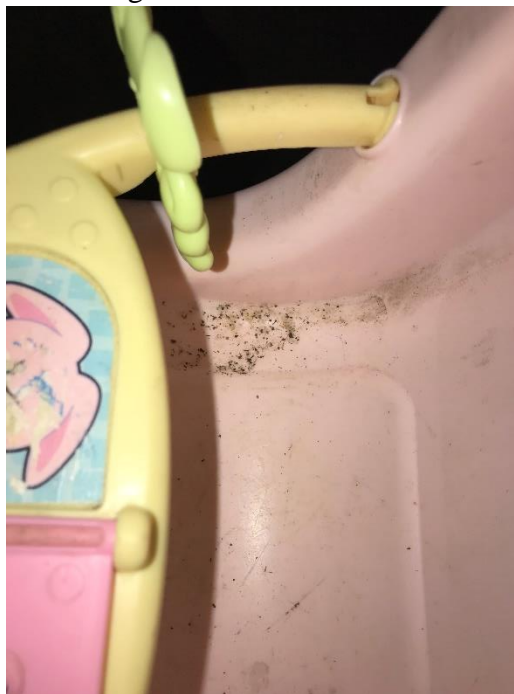
Potential mold present on toys being used by children.