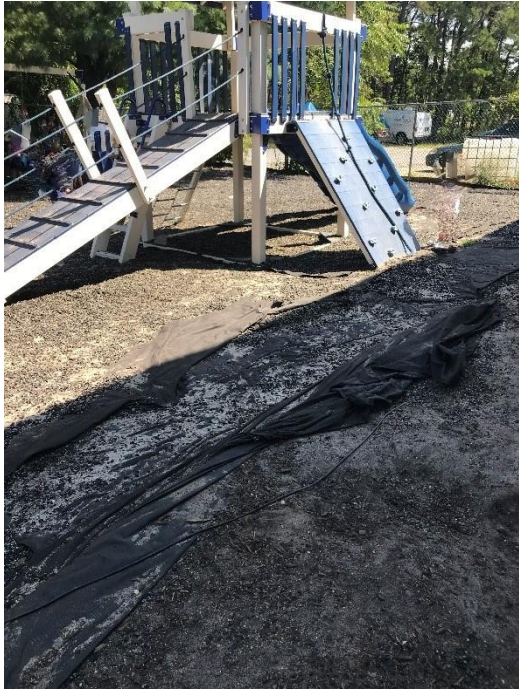
Exposed landscaping fabric.