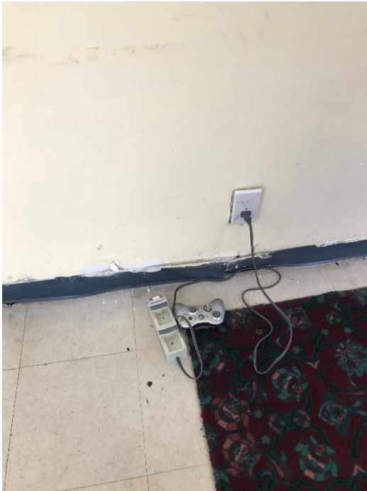
Loose baseboard, chipped paint and dry wall, loose outlet cover, and cords within reach of children.