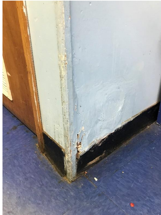
Damaged wall, chipped paint, and loose baseboard.