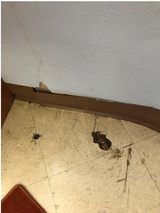
Cracked floor tile, loose baseboard, and exposed chipped drywall.