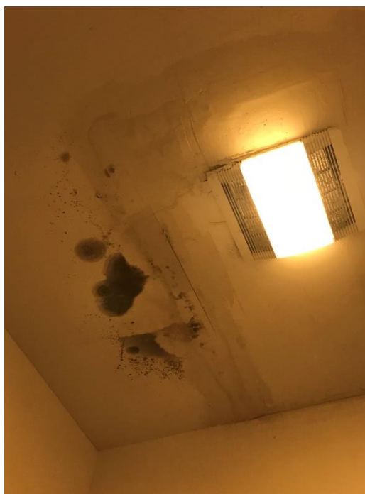
Potential mold on a bathroom ceiling.