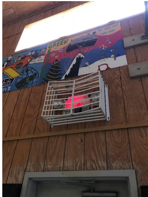
Damaged emergency exit sign.