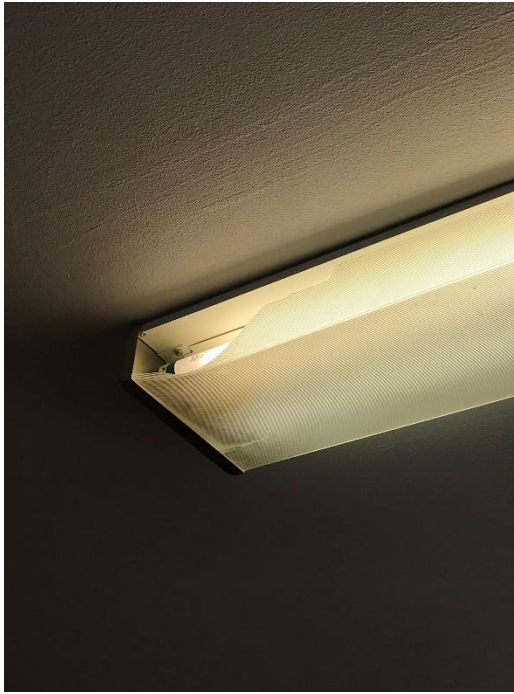
Broken light fixture.