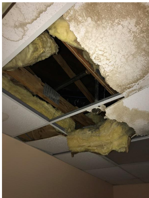
Missing ceiling tiles.

During the 25 unannounced inspections of child care centers, we photographed some of the violations we encountered. See below: