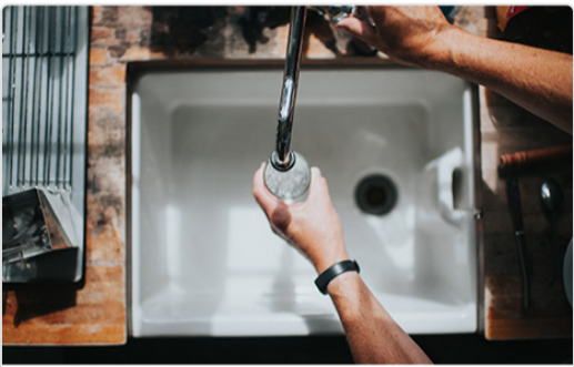
Why Conserve Water?