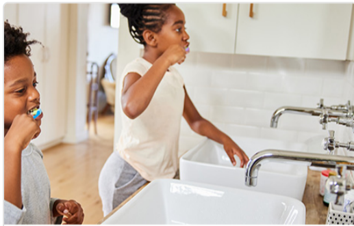
Conserve Water Inside Your Home