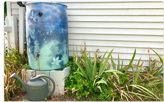
NJ Water Savers