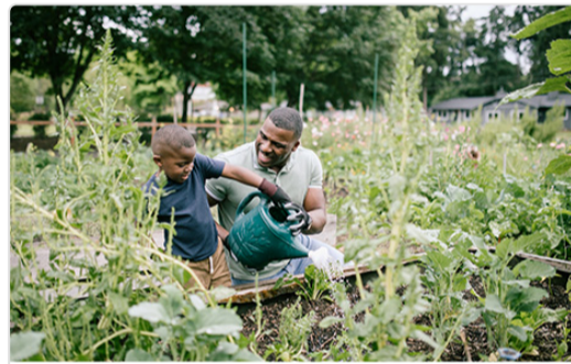
Conserve Water Outside Your Home