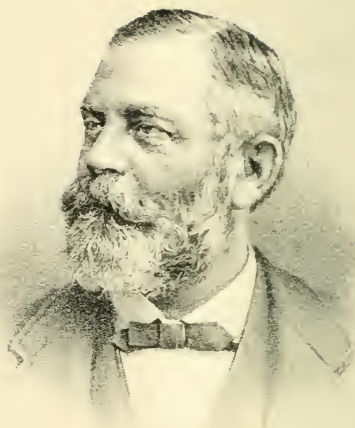
LEON ABBOTT GOVERNOR