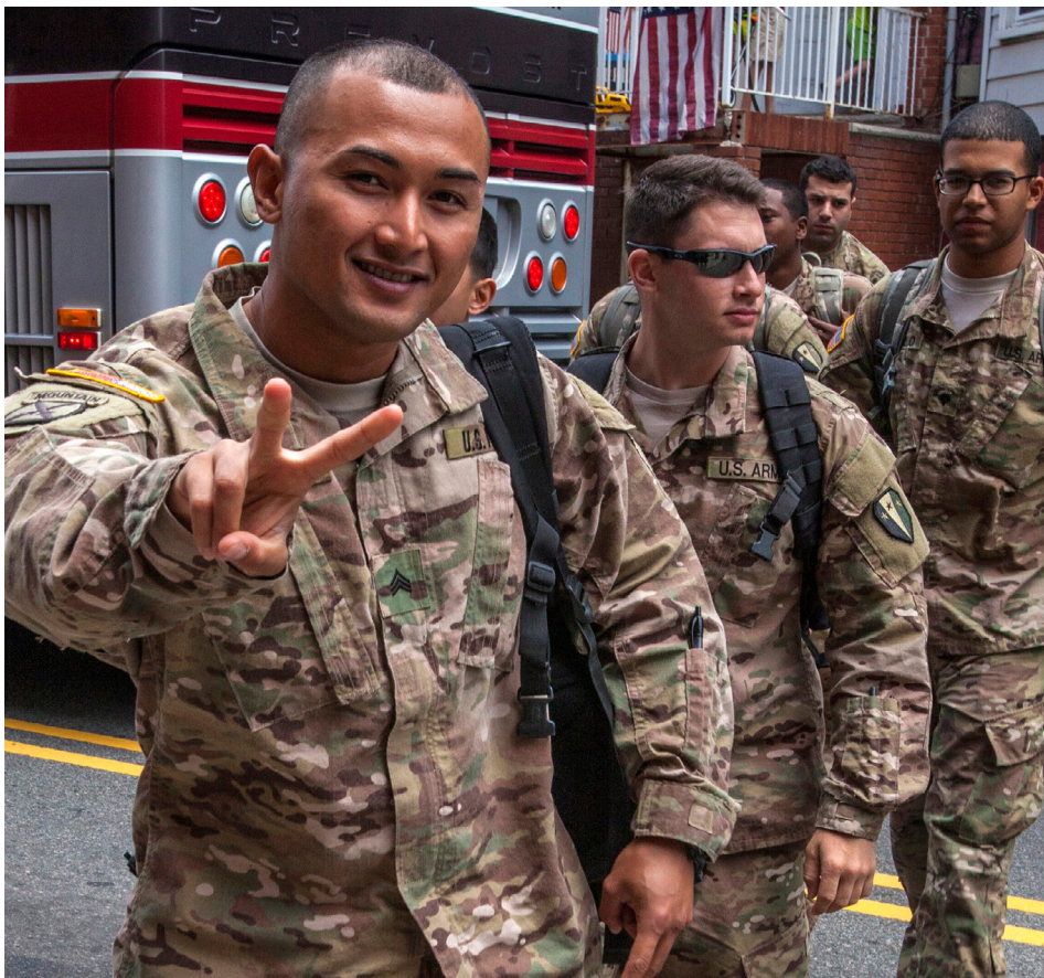
Photo above: Buses carrying Soldiers with A Company, 2-113th Infantry, pass under an American flag on their way to the National Guard Armory in Jersey City, N.J., June 25, 2015, for a welcome home ceremony. Photo right: Alpha Company Soldiers arrive at the National Guard Armory in Jersey City, N.J. The approximately 170 Citizen-Soldiers returned home from a nearly year-long deployment where they conducted a security force mission in Southwest Asia in support of Operations Enduring Freedom and Inherent Resolve.