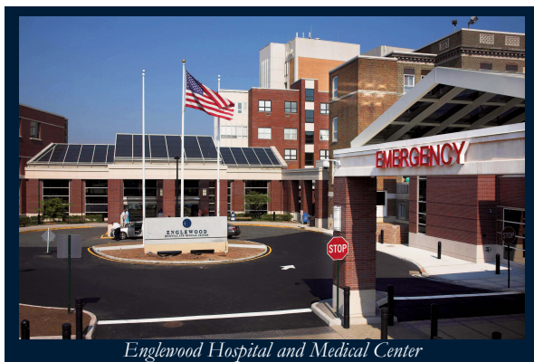
Englewood Hospital and Medical Center

In February of 2011, Englewood Hospital and Medical Center received