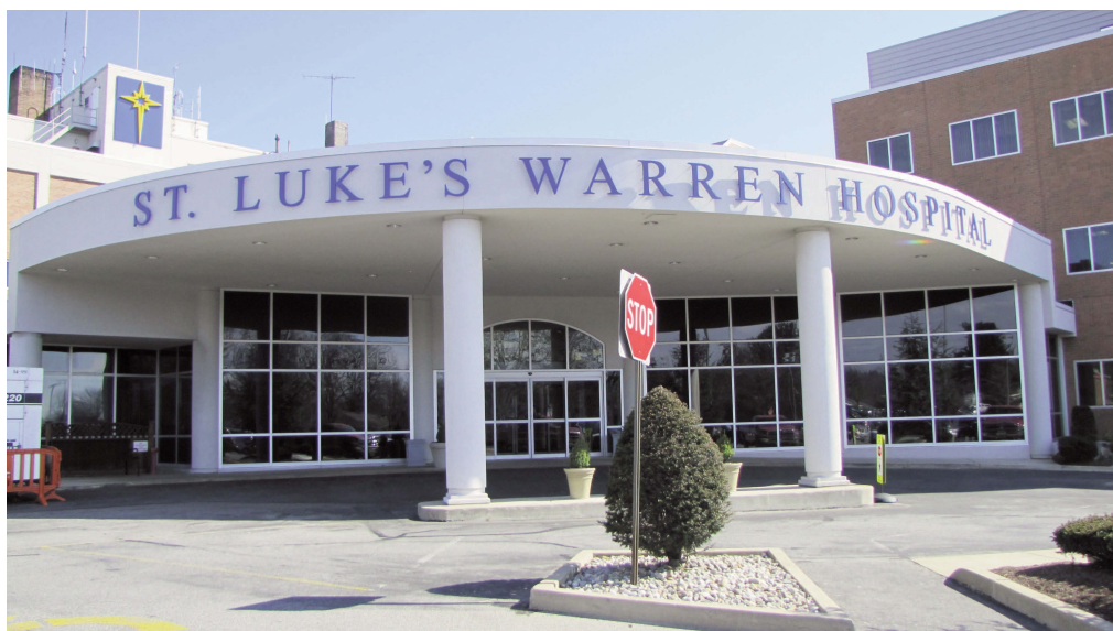
St. Luke's Warren Hospital

St. Luke's Warren Hospital is a 214-bed, not-for-profit general acute care hospital located in Phillipsburg. §