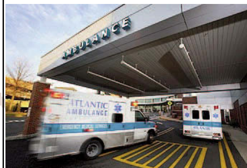
Overlook Medical Center

Proceeds from this sale were used to refund AHS's outstanding 1997 Newton Bonds and provide for the acquisition of capital budget items including the ER & parking garage at Morristown and neuroscience services at Overlook, as well as acquisition and installation of equipment at their three campuses.