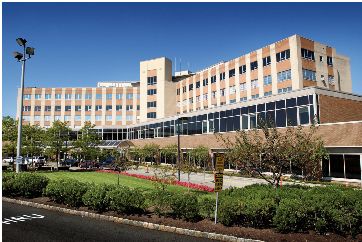
Saint Barnabas Medical Center