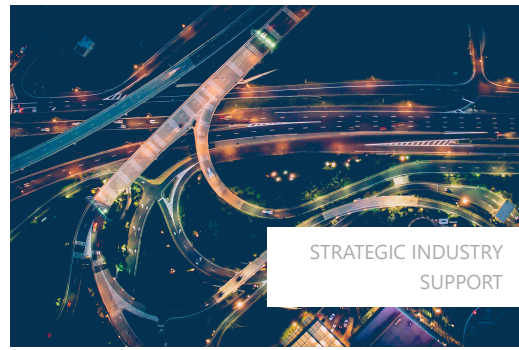
STRATEGIC INDUSTRY SUPPORT