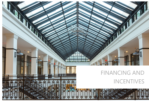
FINANCING AND INCENTIVES