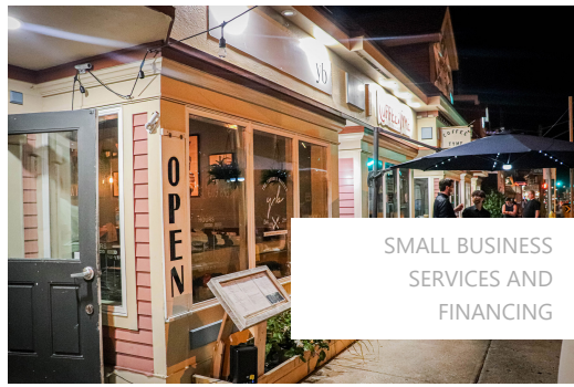
SMALL BUSINESS SERVICES AND FINANCING