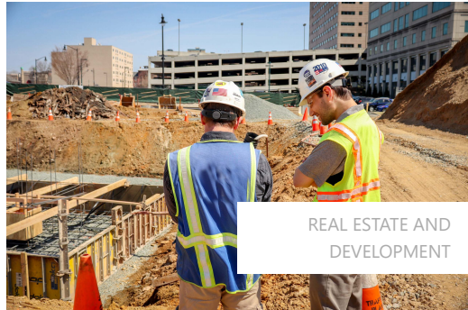
REAL ESTATE AND DEVELOPMENT