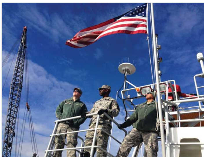
Soldiers from the 21st Civil Support Team (Weapons of Mass Destruction) participate in a maritime familiarization training with the Portland Fire Department Maritime Division, Maine, Nov. 5, 2013.