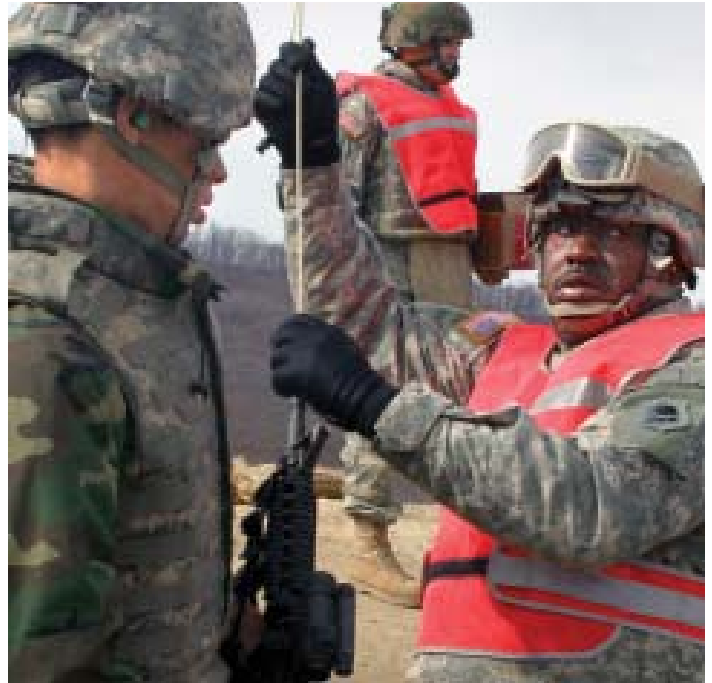
A 50th Personnel Service Battalion Soldier helps a 50th IBCT Soldier clear his gun at the M4 range.

Finally, the 50th PSB ran the M4 ranges, an M203 range, an M9 range, a shotgun range, an M249 range, an M250