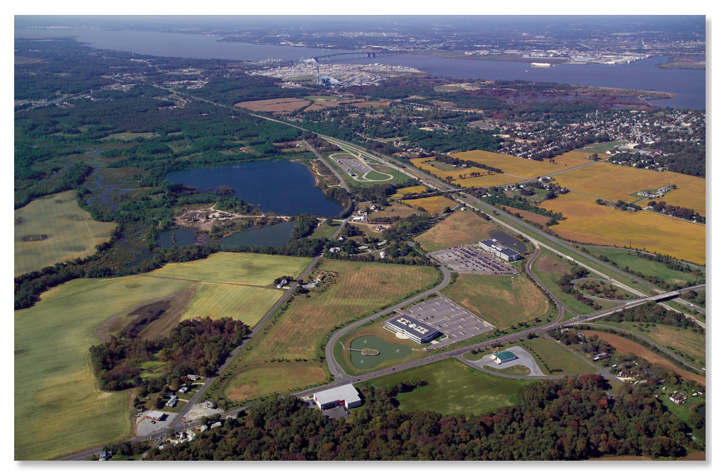
NEW BUSINESS AT SBC — Verizon Wireless plans to build a 40,000-square-foot building on its recently acquired land at the Salem Business Centre shown above.