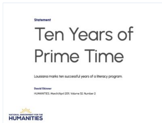
A statement from the National Endowment for the Humanities recognizing the impact of Prime Time Reading