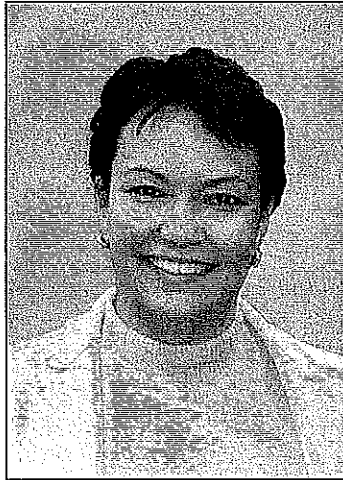
Lisa P. Jackson