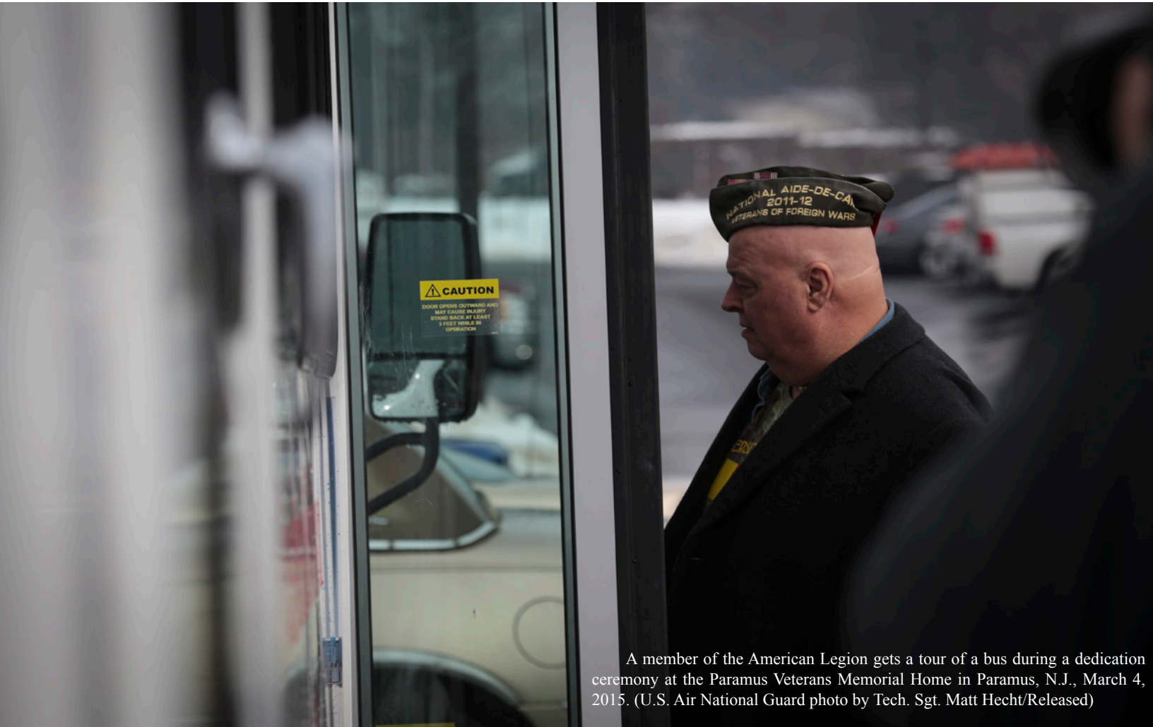
A member of the American Legion gets a tour of a bus during a dedication ceremony at the Paramus Veterans Memorial Home in Paramus, N.J., March 4, 2015.