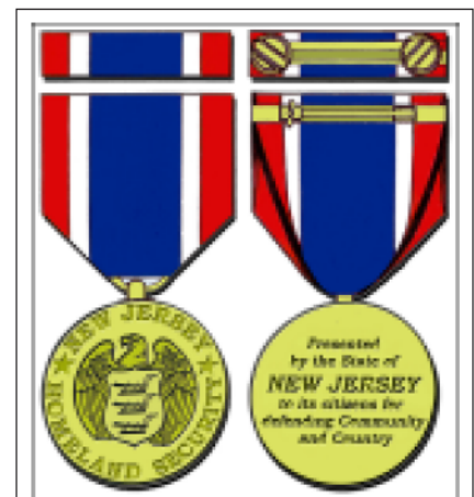
The proposed New Jersey Homeland Defense Medal was designed by Sgt. 1st Class Declan Callan, NJDMAVA/PA.

The ribbon's colors represent our national flag and the Guard's dedication to the federal mission and the American people. The eagle is the vigilant sentry protecting New Jersey. The shield and three plows represent New Jersey's agricultural heritage.