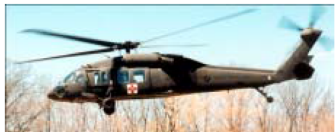
Detachment 1, 1159th Medical Company UH-60 Blackhawk.