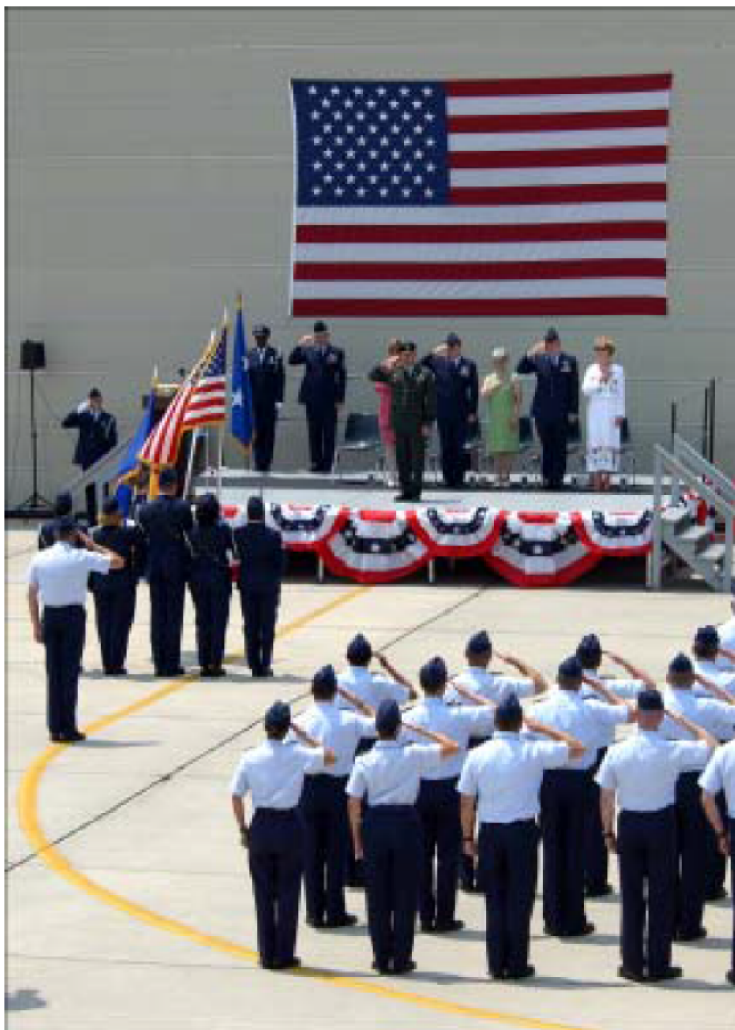
The entire leadership of the New Jersey National Guard leadership and members of the 177th Fighter Wing salute during the New Jersey Air National Guard Change of Command Ceremony held at the 177th June 23.