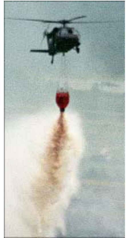
Splashdown. Another 660 gallons of water hits its target.

New Jersey Army National Guard personnel from the Army Aviation Support Facility #1, located at Trenton-Mercer Airport, refitted three UH-60 Blackhawk helicopters with 660 gallon Bambi Buckets. These bright fluorescent orange buckets, which are suspended below the aircraft, are lowered into lakes or ponds, filled with water, and flown to the fire. The buckets, when filled, add 6,000 pounds to the aircraft. The Blackhawks were joined by a UH-1 Huey from Army Aviation Support Facility #2 with a 240-gallon water bucket. The aircrews fought the fire both day and night, using night vision goggles, for the two days. After three days, 408 drops with a total of 213,336 gallons of water, the blaze was under control. ✪