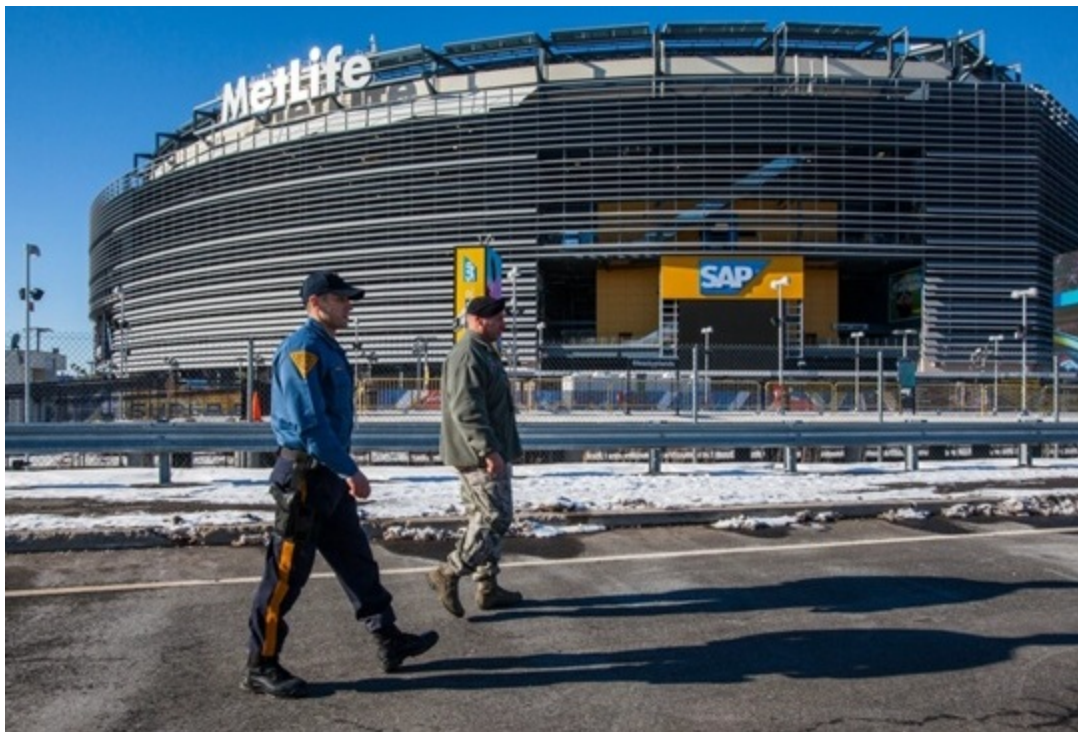
Super Bowl XLVIII