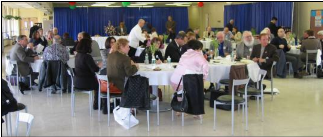
Working Group Teams Receiving Instructions During Convocation Camden County Community College