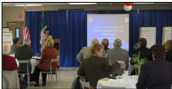
Attendees at the 4 th Italian American Leadership Convocation on March 19, 2005 Hosted at Camden County College