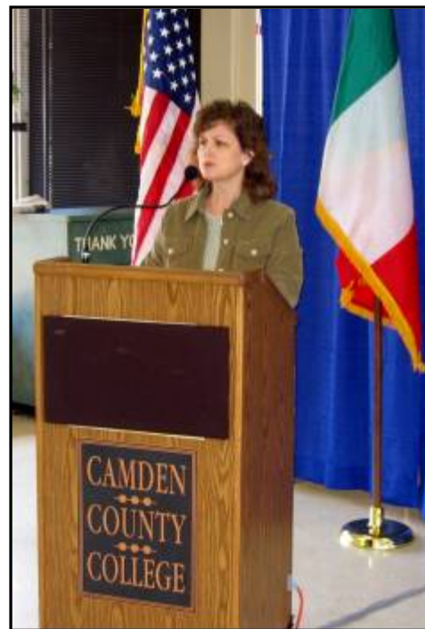
Working Group Team Captain Reporting Italian American Educator