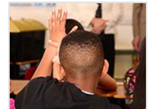
Championing School Breakfast April 16, 2015 - Bound Brook