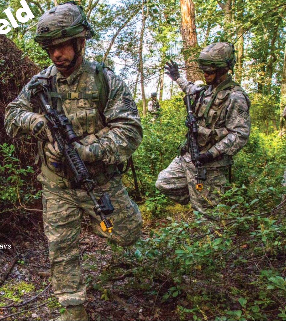
The 108th Security Forces Squadron team practice land navigation as they move through the woods to the military operations