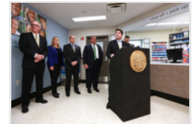
Medication Disposal Program Thursday, December 22, 2016