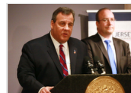
Business Tax Relief Announcement Tuesday, April 12, 2016