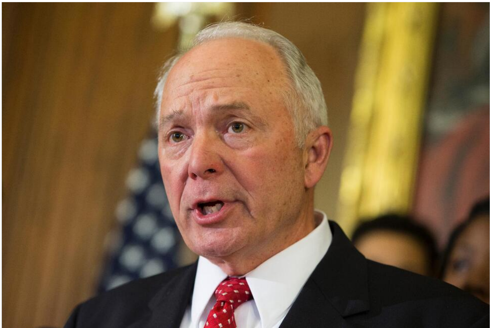
FILE - In this May 7, 2014 file photo, House Education and the Workforce Committee Chairman Rep. John Kline, R-Minn. speaks during a news conference on Capitol Hill in Washington. The House is ready to vote Wednesday on a long-sought rewrite of the 2002 No Child Left Behind education law that would roll back the federal government's authority to push academic standards and tell schools how to improve.