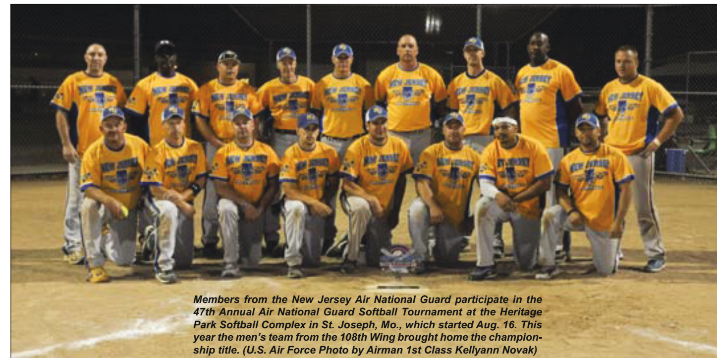
Members from the New Jersey Air National Guard participate in the 47th Annual Air National Guard Softball Tournament at the Heritage Park Softball Complex in St. Joseph, Mo., which started Aug. 16. This year the men's team from the 108th Wing brought home the championship title.