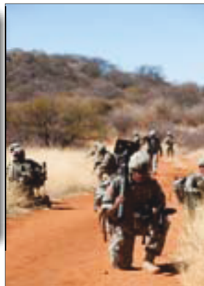
Mortarman of Company C. 1st Battalion, 114th Infantry Regiment fire carry their equipment to their firing positions during the field training exercise at Shoshong Range.