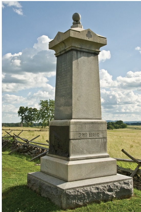
The 12th New Jersey monument at Gettysburg.