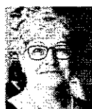
Diane Gutierrez-Scaccetti Commissioner NJ Department of Transportation