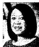
Sheila Y. Oliver Lt. Governor, State of NJ Commissioner, Department of Community Affairs