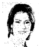
Mayor Wilda Diaz City of Perth Amboy