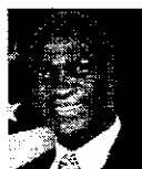
Mayor Adrian O. Mapp City of Plainfield