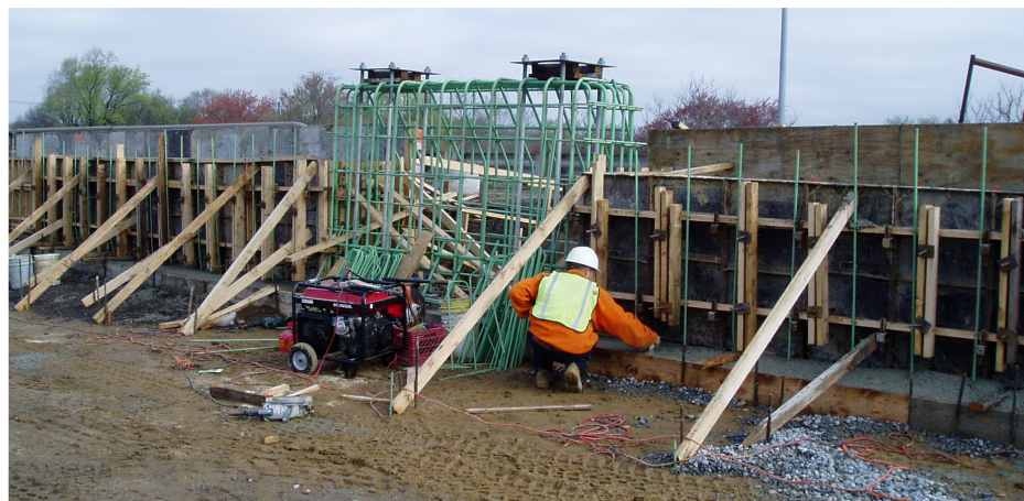
CONSTRUCTION — Work on a I-295 overpass is part of the Phase III project.

· Steelwork Full Overcoat Rehabilitation System, 2nd Structure: a full repaint-