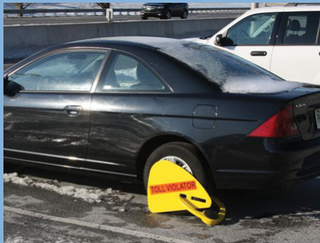
BOOTED — The first vehicle immobilized by the DRBA for habitual toll violation is pictured above with the "boot" attached.