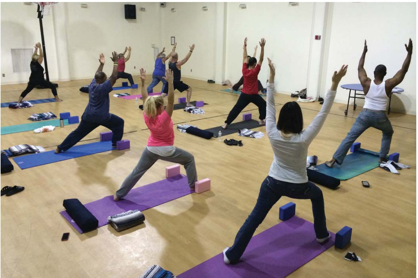
Yoga instructors from Kula for Karma conduct the Wednesday weekly yoga class for the residents of Veterans Haven North in Glen Gardner Sept. 18, 2014. The veterans of the facility began a regimen of therapeutic yoga designed to deliver healing, recovery and empowerment through a program tailored to help the specific needs that each veteran has. Kula for Karma is a 501 C3 organiza-