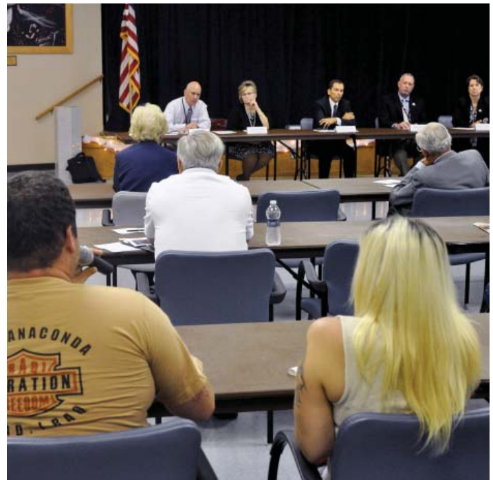
The federal Veterans Administration Wilmington (Del.) Medical Center held a town hall at the Vineland Veterans Memorial Home on Monday. Two dozen veterans came out to ask questions to the medical center staff that oversee VA clinic in South Jersey.