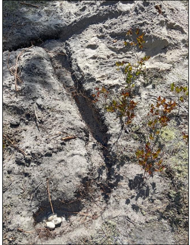
Above: A pine snake nest excavated as part of the Rare Snake Monitoring Project. Female pine snakes dig a long tunnel and deposit their eggs in an underground cavity.