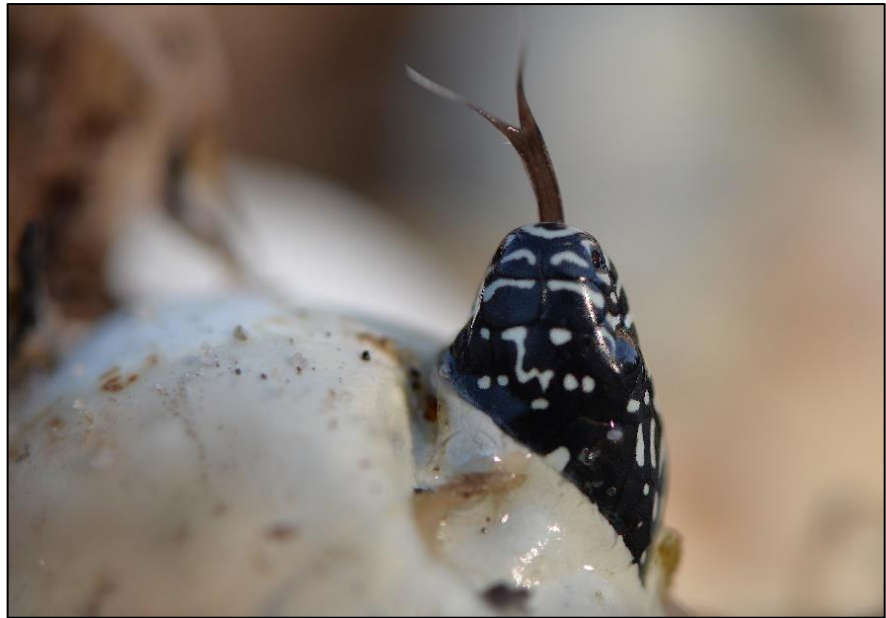
Above: An eastern king snake hatchling “tasting” fresh air for the first time.

Science staff have initiated the process of applying to the Environmental Protection Agency for additional funding to help complete the King Snake Study. It is possible that some funding may be available at the start of the next federal fiscal year in October.