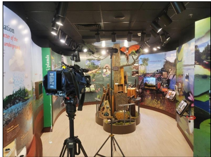
Above: A WPVI-TV Action News reporter/cameraperson interviewed a Commission staffer about the Jersey Devil on August 11, 2022.