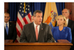
Hurricane Joaquin Press Briefing Thursday, October 01, 2015