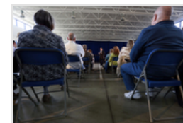
March 17, 2015 Freehold Town Hall