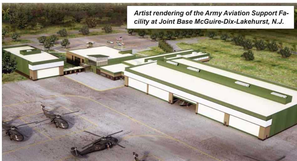
Artist rendering of the Army Aviation Support Facility at Joint Base McGuire-Dix-Lakehurst, N.J.

"The men and women of the 1-150th Aviation Battalion have proven their capabilities and commitment to service both at home and abroad," he said.